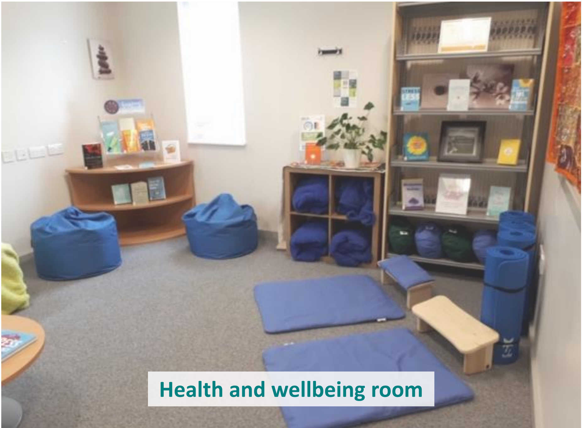
Health and wellbeing room